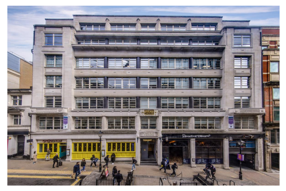
Edinburgh Land and Property Ltd, Edinburgh, Scotland

All three (3) current tenants have occupied the premises for several years with rental contracts expiring only after 10 years or beyond. The pro forma annual rent 2023 amounts to GBP 1.4 million exclusive of VAT. Over 75% of rental income is earned from one tenant who rents upper floors 1-6 as office space and part of the basement. The remainder comes from two retail tenants on the ground floor.